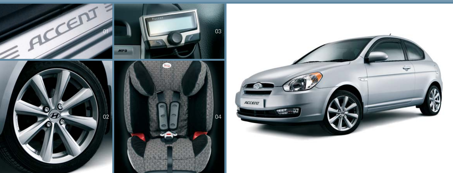
01 Aluminium entry guards 02 16" alloy wheels 03 Parrot CK3100 handsfree car kit 04 Britax Evolva 123 child seat Main picture shows a 1.4 CDX in Space Silver, fitted with: • Mud guards • 16" alloy wheels

accessories There's little room for improvement when you drive a Hyundai Accent Atlantic, but at Hyundai we pride ourselves in offering customers a range of accessories* that is truly extensive. Each item will help you get more out of your car by enhancing either its practicality or style.