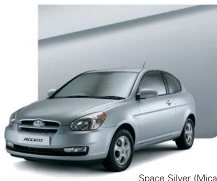
Space Silver (Mica)