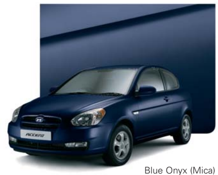
Blue Onyx (Mica)