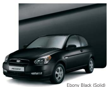
Ebony Black (Solid)