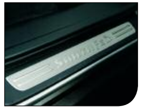
Deluxe Door Scuff Trim*