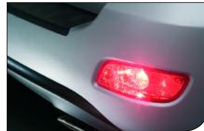
Rear Fog Lights