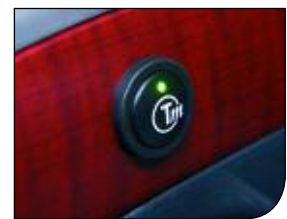
Smartnav™ - Standard on CDX+