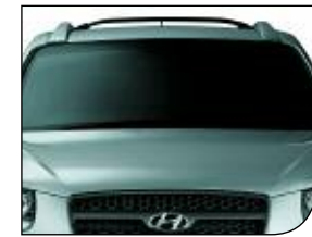
Front Windscreen De-icer* (Rain Sensor also available on CDX+)