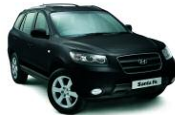
Black Pearl (Mica)