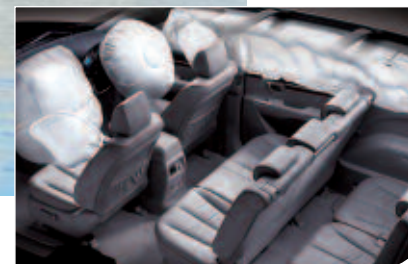
Multiple Air Bags

Hyundai recommend avoiding exposure to salt water conditions, as this could risk invalidating your Anti-perforation Warranty.