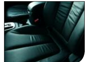
Leather Seats - Standard on CDX and CDX+