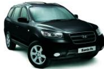
Ebony Black (Solid)

The Santa Fe is a car to be seen in and will turn heads as well as it turns corners.