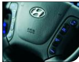
Steering Wheel Mounted Cruise Control and Audio Controls*