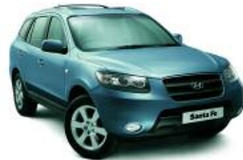
Blue Titanium (Metallic) ▼