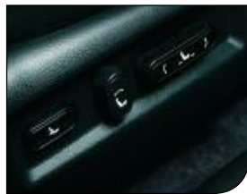
Electric Seat Adjustment**†