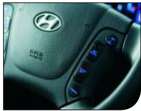
Cruise Control with steering wheel controls*