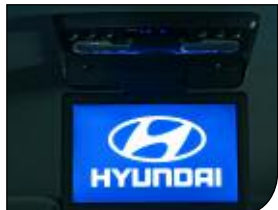
DVD Multi Media System - Standard on CDX+