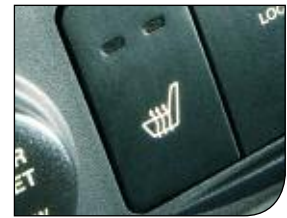
Heated Front Seats - 2 Stage Control*