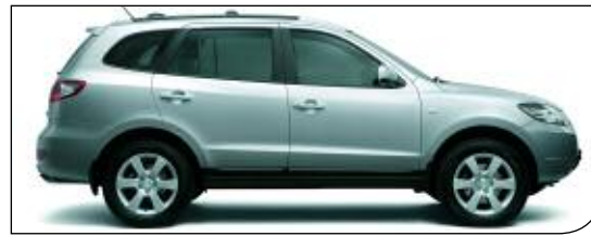
Self-levelling Suspension - 7 Seat only