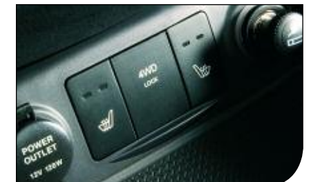
4WD System - Torque on Demand with Lock-in 4WD Function