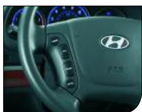
Steering Wheel Mounted Audio Controls*