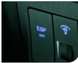
Traction Control System plus ABS with EBD (ESP also available on CDX and CDX+ models)