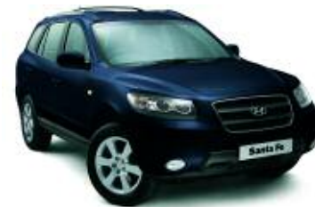
Blue Onyx (Mica)