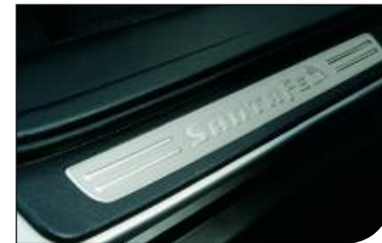
Deluxe Door Scuff Trim*