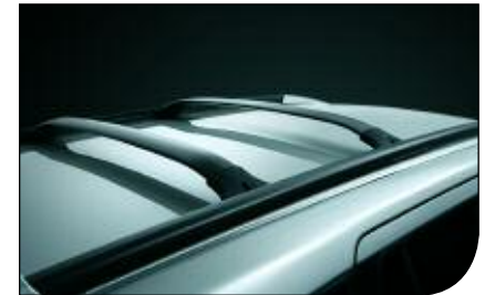
Roof Rails with Crossover Bars