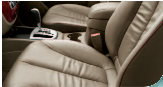
Beige▼ Leather Upholstery. (Leather standard on CDX and CDX+)

The spacious cabin is ergonomic and efficient, with fingertip controls, integrated console and instrument panel. Wood and alloy effect are used tastefully, mixing tradition with modernity, allying strength with safety. Stylish blue instrument lighting boosts visibility and dual zone climate control (CDX and CDX+) or manual air conditioning (GSI) help you keep cool and composed. For your listening pleasure we have installed a fully integrated and highly versatile audio system giving you up to 7 speakers, a cassette player, single slot CD (6 disc in-dash player, CDX and CDX+) and MP3 playing capability.