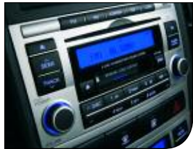
Multi-function Integrated Audio (CDX and CDX+ version featured)