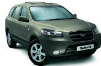
Natural Khaki (Metallic) ▼