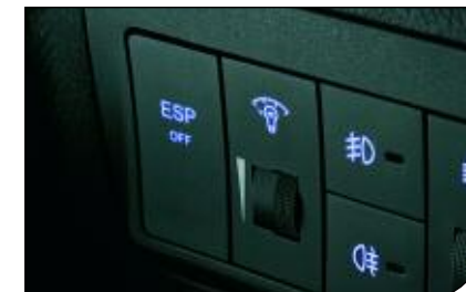
Electronic Stability Programme, state of the art Control and Stability System*