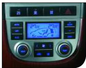
Dual Zone Climate Control*