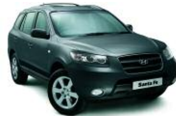
Gun Metal (Metallic)