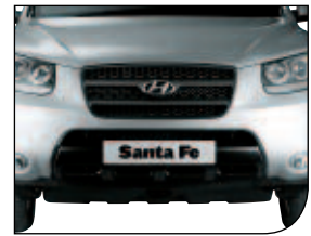
Underbody Skid Plate protection