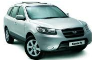
Platinum Silver (Metallic)